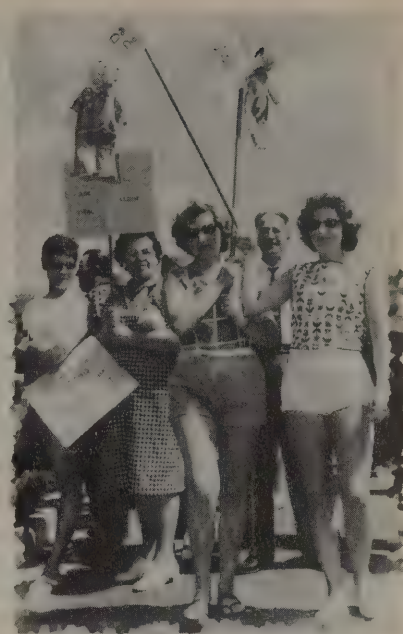
A beautiful day for hanging effigies. The signs say "Down With Dictators," "Doctors Are Vital — Is [Premier Woodrow] Lloyd?" and "Weyburn Objects!"

The implication was not lost on their patients. Once public health insurance was enacted, they would no longer receive health care.